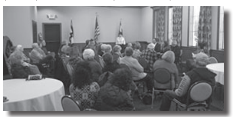
Lively discussions are often a part of an OLLI class.

You can opt out of receiving our printed catalog. All classes and special events are listed on the OLLI registration site, and courses that are added after the catalog goes to print will be there as well. Members who opt out of the printed catalog will receive a PDF (electronic) copy of the catalog as soon as it is sent to the printer, even before it goes out in the mail.