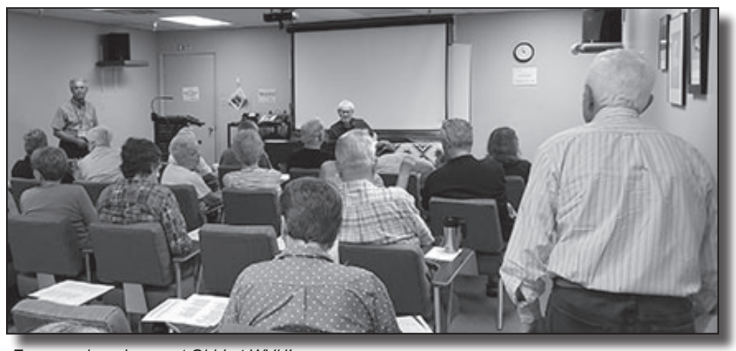
Everyone is welcome at OLLI at WVU!