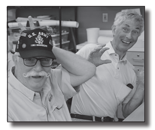
There's often laughter and shenanigans when you're with friends.

To become an OLLI volunteer, contact the OLLI office at 304-293-1793 or submit the Volunteer Information Form online at http://www.olliatwvu.org.