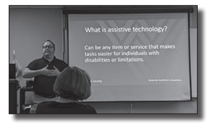
OLLI members learned about the Assistive Technology Library available through WVATS.

You can opt out of receiving our printed catalog. All classes and special events are listed on the OLLI registration site, and courses that are added after the catalog goes to print will be there as well. Members who opt out of the printed catalog will receive a PDF (electronic) copy of the catalog as soon as it is sent to the printer, even before it goes out in the mail.