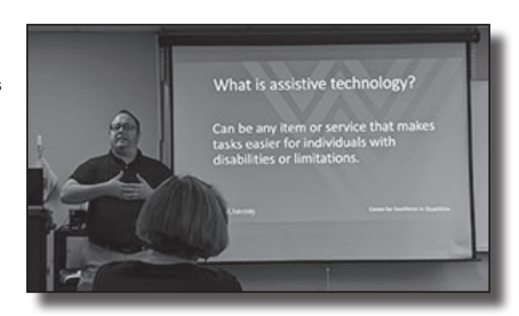
OLLI members learned about the Assistive Technology Library available through WVATS.

You can opt out of receiving our printed catalog. All classes and special events are listed on the OLLI registration site, and courses that are added after the catalog goes to print will be there as well. Members who opt out of the printed catalog will receive a PDF (electronic) copy of the catalog as soon as it is sent to the printer, even before it goes out in the mail.