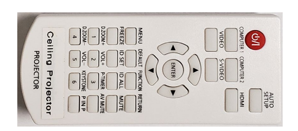
Ceiling Projector Remote