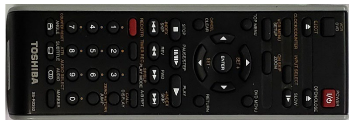
DVD / VCR Remote

Hearing Assist Devices are available in the Main Office.