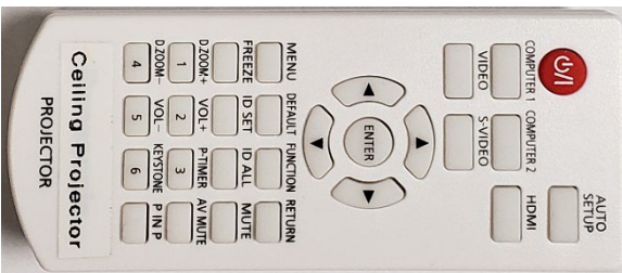
Ceiling Projector Remote