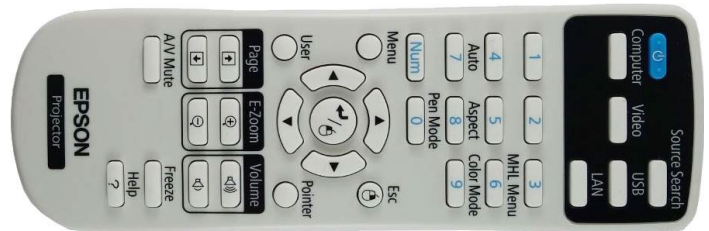
Smart Board Remote